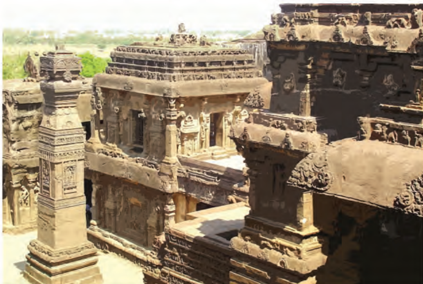
Kailas Temple at Ellora

Shilaharas : There were three branches of this dynasty – Shilaharas of south Konkan, north Konkan and Kolhapur. They called themselves as ‘Tagarapuradhiswar’ (Tagar-Ter, Osmanabad district). Jimutvahan is considered as the founder of all the three branches. They ruled for almost three hundred years as the feudatories of Rashtrakutas and later the Chalukyas.