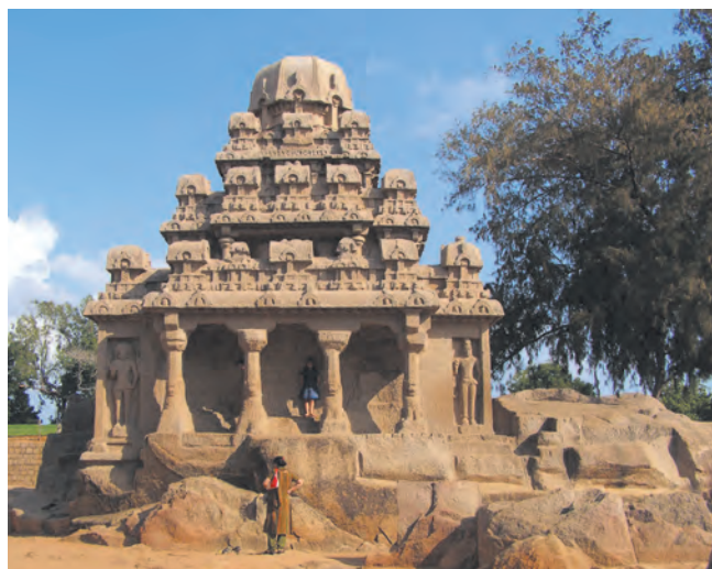
Yudhisthira Rath Temple at Mahabalipuram

were built at Tiruchirapalli, Chingalput and in east and west Arkat district. The war between Pallavas and Chalukyas took place during his period. His son Narsimhavarman defeated the Chalukyan Emperor Pulakeshi II. During Narsimhavarman's region, many temples were built at Mahabalipuram. It includes the monolithic temples (Rath Mandiras) as well. Yuan Chwang, the well-known Chinese traveller, was in his court for a certain period of time. The literary works by Narsimharvarman are important as major source of Pallava history. The Pallava rule ended in 9 th century C.E. The Chola king, Aditya, defeated the Pallavas and destroyed it.