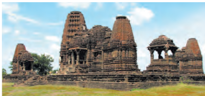
Gondeshwar Temple at Sinnar

'Lilacharitra' written by Mhamimbhatta of the Mahanubhava sect, 'Viveksindhu' by Mukundaraj, 'Bhavarthdipika' by Dnyaneshwar belong to this period. Similarly the composition of saint poets like Namadeva, Janabai, Chokhoba of the Varakari sect composed poems, which are known as 'Abhangas'. Many temples were built in this period. They are generally referred to as 'Hemadpanti' temples. The Gondeshwar temple at Sinnar and the temple complex at Anjaneri are the finest example among the temples built during this period. An important feature of the Hemadpanti temples is that no mortar is used. Instead the stones are interlocked with the help of mortise and tenon. During this period, the crucial forts of Ankai and Tankai were constructed.